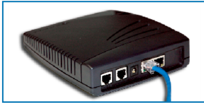
Step #2 - Connect the WAN port.