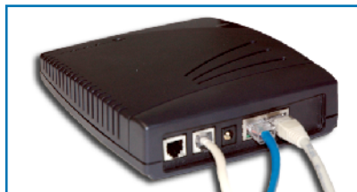
Step #4 - Connect your telephone.