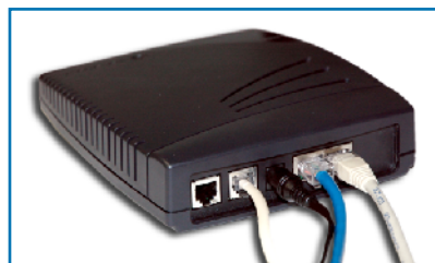
Step #6 - Power on your ATA Phone Adapter